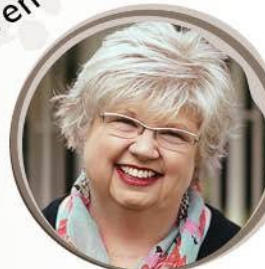
LIZ CURTIS HIGGS best-selling author